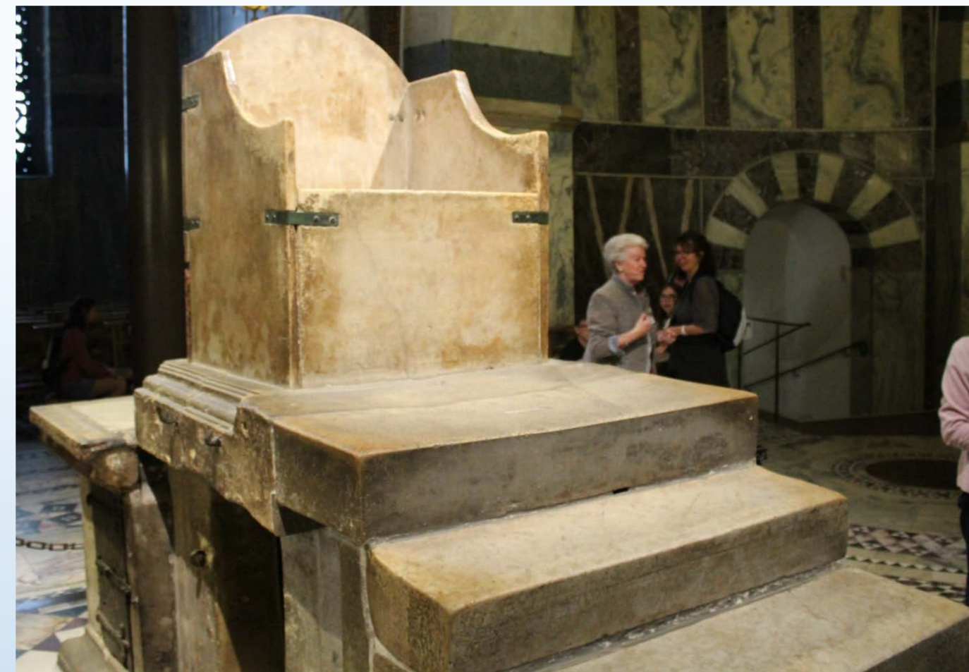
Figure 2. Throne of Charlemagne, made by Otto I from reused Roman marble, an act known as spoila.