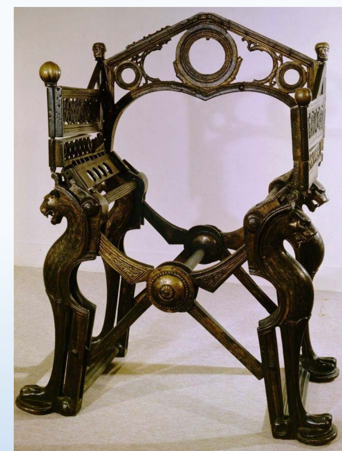
Figure 1. Sella curulis of Dagobert, copying a chair design associated with Roman magistrates and priests (World Digital Library 2018).